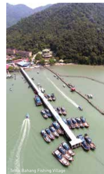
Teluk Bahang Fishing Village

Teluk Bahang was originally founded as an agricultural village where the majority of the population were fishermen. Over the years, it has gradually developed into a tourist destination dotted with a wide variety of attractions such as beaches, parks, gardens, theme parks, museums and farms. Serving as the perfect backdrop for photos, the captivating views add to its rustic charm.