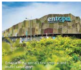
Entopia - the world's first tropical and insect sanctuary

Another way to experience the wonders of nature is to visit Entopia by Penang Butterfly Farm, nature's largest classroom and discovery hub, where butterflies and insects are free to come out and play. This venue is actually two different worlds side by side; The Natureland living outdoor gardens and The Cocoon indoor discovery centre. Over 150 species of fauna and more than 200 species of flora call this man-made wonderland home.