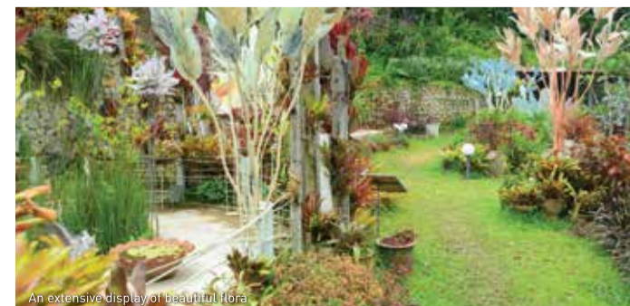
An extensive display of beautiful flora

Fruits from Around the World It has an impressive collection of rare and exotic fruit trees from the region, Central and South America, Central Africa, India, the Middle East, the Caribbean, the Pacific Islands and more.