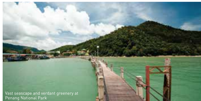
Vast seascape and verdant greenery at Penang National Park

Filled with many flourishing species of flora and fauna, the Penang National Park is a treasure trove of natural wonders comprising coastal hill dipterocarps, mangroves, beaches, and rocky shores. There are plenty of avenues to observe and photograph birds and forest animals in their natural habitat. With such a wide range of activities available, there is no reason to get bored in here.