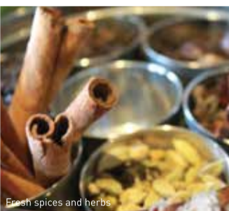
Learn spices and herbs

An olfactory heaven awaits in the form of Tropical Spice Garden . It is Southeast Asia's one and only award-winning tropical garden spanning over 8 acres of secondary jungle, filled with more than 500 tropical species of flora and fauna. Tropical Spice Garden was once an abandoned rubber plantation until its founders turned it into a tropical paradise with a soothing, zen-like environment. However, if you are not one to enjoy simply walking around the gardens, there are plenty of other activities to take part in.