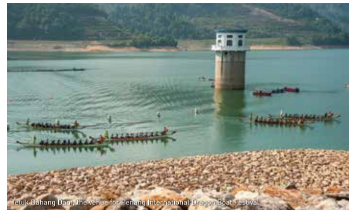
Teluk Bahang Dam, the venue for several international dragon boat festivals

Known as the largest dam in Penang, the Teluk Bahang Dam was built to serve as an alternative water supply. From its crest, one can enjoy a scenic view of the northern coast of the island. The dam has a height and length of 58.5m and 685m respectively, and a crest 12 metres thick, allowing for a roadway to be built along it.