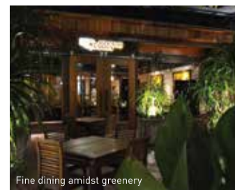
Fine dining amidst greenery

If you traverse beyond Teluk Bahang, drop by the adjacent Batu Ferringhi for numerous culinary options: Western fare and seafood at Ferringhi Garden , Middle Eastern cuisine at Grand Lebanon , Malaysian-style menu items at Andrew's Kampung , local and Western food, booze and non-alcoholic drinks at Bora Bora by Sunset and more.