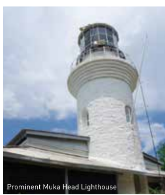
Prominent Muka Head Lighthouse

From there, you can choose to hike on for another 40 minutes to go to the Muka Head Lighthouse . Known as one of the three landmark lighthouses in Penang, it was built during the 1880s by the British administration as a guide to approaching boats. A stairway is open to the public from 9am to 3pm, spiraling all the way to the top of this prominent white granite tower from which a mesmerizing vista of the blue-green sea at Batu Ferringhi and Teluk Ketapang can be enjoyed.