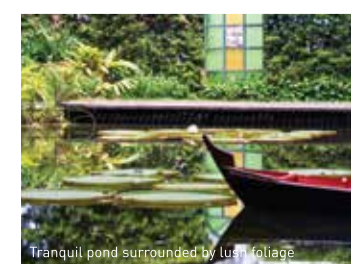
Tranquil pond surrounded by lush foliage

Beauty of the Night If you are feeling especially adventurous, there are even Night Walks available every 2nd and 4th Saturday of the month (advance booking required) where you can learn more about the Garden's nocturnal side. Children will be kept busy learning about nature through various Nature Education Programs.