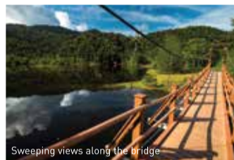
Sweeping views along the bridge

Visitors to the National Park are required to register at the park's main entrance. A map of the park can also be obtained here.