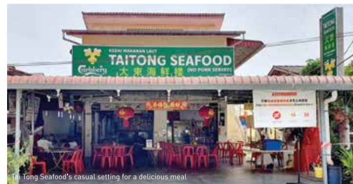
Tai Tong Seafood's casual setting for a delicious meal

As part of the nation's food capital, Teluk Bahang is hailed by many as a place filled with fresh and mouthwatering seafood (after all, it is a fishing village). One of the restaurants that has received many positive reviews is Tai Tong Seafood . This type of restaurant often presents basins from which guests are invited to handpick their own live seafood to be prepared on the spot. Food doesn't get any fresher than that!