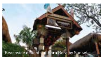
Beachside delight at Bora Bora by Sunset

Hankering for authentic local favourites apart from seafood? Among the go-to spots is Belimbing Cafe Corner , widely known for its generously sized roti jala. Savour it with your preferred curry, along with dishes such as roti canai and roti planta.