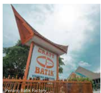
Penang Batik Factory

Interested in learning more about batik culture? Head over to Penang Batik Factory and join the free guided daily tour around the art gallery, boutique and factory where hand-drawn, manually block-printed and hand-painted batik are produced. Unlike the usual one-sided print, every fabric piece here is unique as it has patterns and colours on both sides.