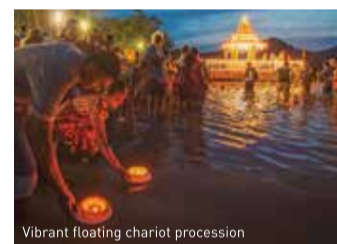
Vibrant floating chariot procession

The Floating Chariot Procession (Masi Magam Theppa Thiruvizha) is a Hindu festival that attracts tens of thousands of devotees to Sri Singamuga Kalliamman Temple between mid-February and mid-March. The ceremony is held to thank the Goddess, Sri Singamuga Kalliamman for her good grace and to ask her for protection and prosperity. During this elaborate procession, the Goddess will be carried on a floating chariot adorned with lights and flowers along the seaside of Teluk Bahang.