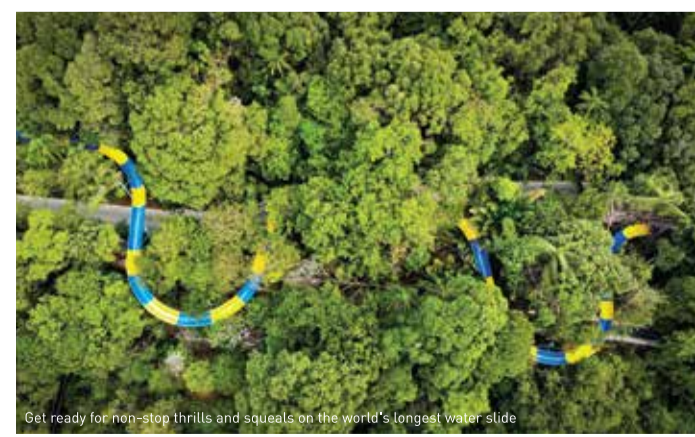
Get ready for non-stop thrills and squeals on the world's longest water slide

Looking for exciting adventures and adrenaline-pumping thrills? Experience it all at ESCAPE where lots of exciting attractions await! Don't miss the chance to ride the world's longest water slide, measuring an impressive 1,111m! Winding through enchanting jungle treetops, this Guinness World Record water slide is packed with twists and turns for a mind-blowing four-minute ride.