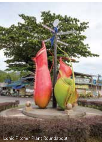
Iconic Pitcher Plant Roundabout

Beauty. Serenity. Harmony. These words describe Teluk Bahang very well. Its name means 'bay of heat wave' which refers to the hot sea breeze that blows onto the coast. This small, idyllic fishing village is situated at the northwestern tip of Penang Island. Ironically, it is considered as part of the Southwest Penang Island District, which extends to include the majority of the island. Its soothing and welcoming atmosphere complements the beautiful natural landscapes that can be seen throughout the village.