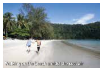
Walking on the beach amidst the cool air

Annual Homecoming Green sea turtles can be seen coming up on Pantai Kerachut to lay their eggs from April to August each year while olive ridley turtles come here during the months of September through February.