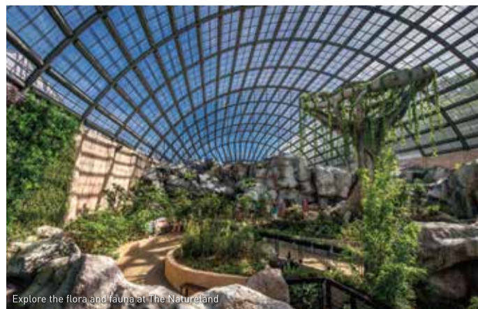
Explore the flora and fauna at the Natureland

The Cocoon is a state-of-the-art facility built along clean and modern lines. It features two floors of exhibitions designed to enhance learning as well as various indoor activities.