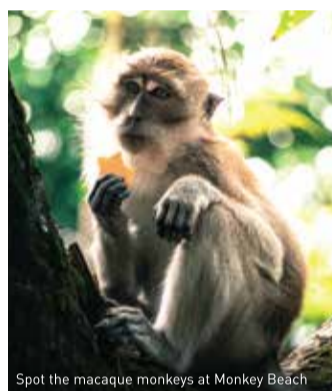
Spot the macaque monkeys at Monkey Beach

There are a few hiking trails beginning at the park entrance, each leading to different havens and wonders. The first trail is fairly easy and bears west for roughly 1.5 hours of easy walking before reaching the first stop, Monkey Beach derived its name from the macaque monkeys living within the vicinity. Accessible by boat or a hike, this scenic beach has shacks selling drinks and snacks as well as vendors offering water sports and quad bike excursions.