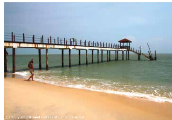
Serenity amidst sand and sea at Pantai Kerachut