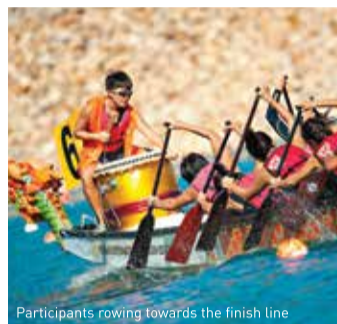
Participants rowing towards the finish line

Vibrant Dragon Boats Did you know that the dragon emblem represents unity? This is because the dragon is said to be a combination of other Chinese zodiac animals. The brightly coloured dragon boats usually have intricate designs in the form of a dragon head and tail.