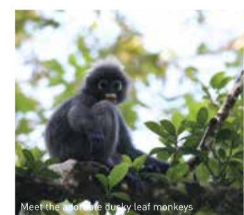
Meet the cute little busy leaf monkeys

An olfactory heaven awaits in the form of Tropical Spice Garden . It is Southeast Asia's one and only award-winning tropical garden spanning over 8 acres of secondary jungle, filled with more than 500 tropical species of flora and fauna. Tropical Spice Garden was once an abandoned rubber plantation until its founders turned it into a tropical paradise with a soothing, zen-like environment. However, if you are not one to enjoy simply walking around the gardens, there are plenty of other activities to take part in.