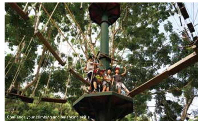
Challenge your climbing and balancing skills