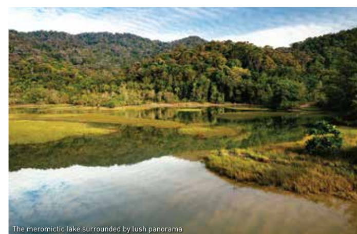
The meromictic lake surrounded by lush panorama

Natural Meromictic Lake Did you know there are fewer than 20 natural meromictic lakes in the whole world? Another natural meromictic lake is the famous Dead Sea. However, the Dead Sea is a permanent lake while ours is seasonal, happening during the change of monsoon (typically April-May and October-November).