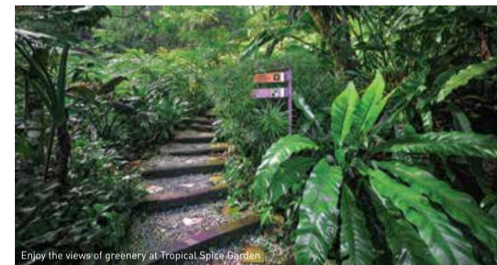
Enjoy the views of greenery at Tropical Spice Garden