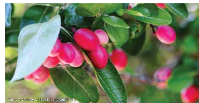
Enjoy a variety of freshly picked fruits

Tropical Fruit Farm is an organic orchard measuring 25 acres with over 250 types of nutrient-rich tropical and subtropical fruits. There are 30-minute guided farm tours (available in English or Mandarin) conducted periodically from 9am to 5pm daily. After the tour, you will get the chance to relax and enjoy the breathtaking view while sampling a wide variety of freshly cut fruits and fruit juices. There will also be lunch and dinner buffets with a free flow of fruits available with prior booking.